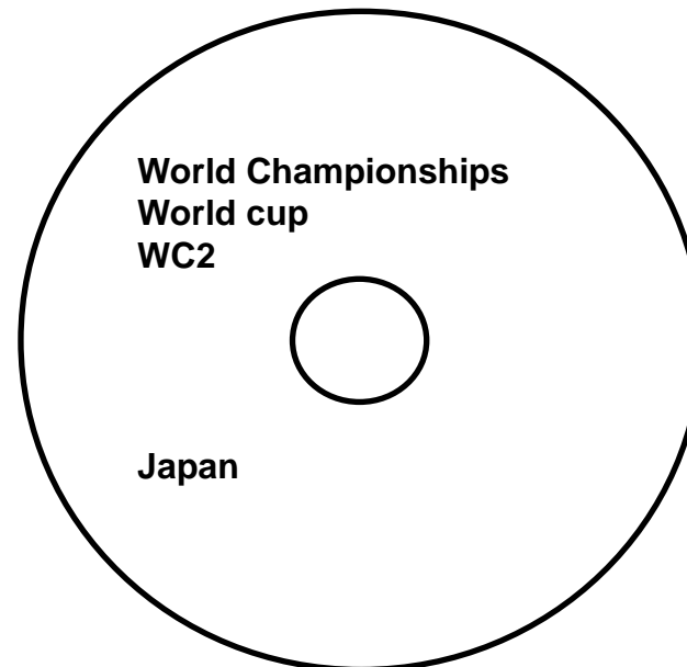
World cup example

*The same information is to be notated on USBs as well.